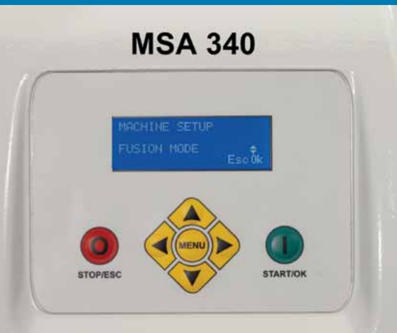
Easy-to-handle navigation keypad

The MSA 340 calibration kit allows customers to calibrate the unit on their own without having to ship it to our facility or even open the box. This reduces shipping expenses and down time, lowering the overall cost of ownership. In addition, the kit itself does not need to be returned to GFCP for regular recalibration.