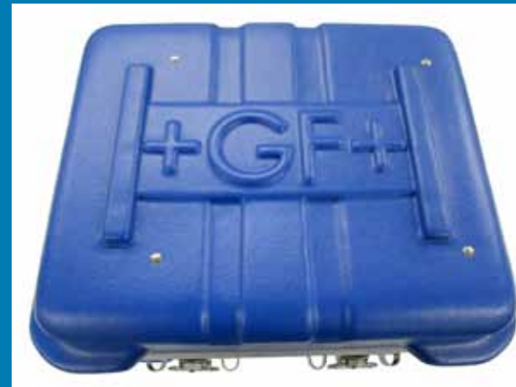
New Enclosure Stow-and-Go Model

The MSA 340 is easy and intuitive to use. In addition, it offers the ability to record GPS data and has an embedded rental duration control feature.