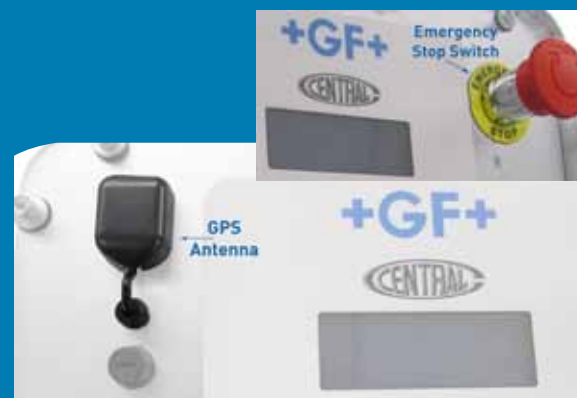
Emergency Stop Switch and GPS Antenna